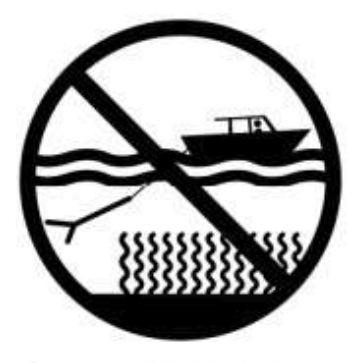
Do not pull behind a boat