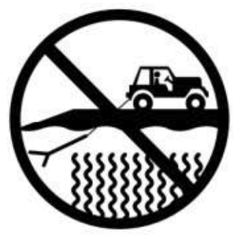
Do not pull behind a vehicle or any mechanical device